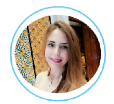
BlueMed Y.C. Ambassador In Tunisia